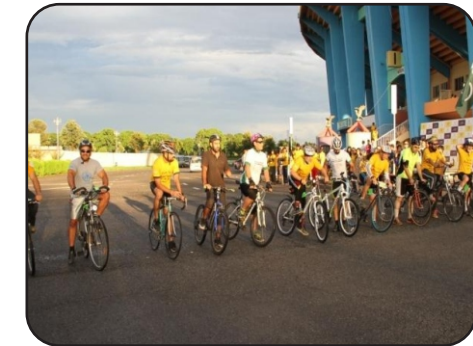
ANF Participation in Program Titled "Save Tomorrow" An Event To Mark International Overdose Awareness Day - 27 Aug 2016