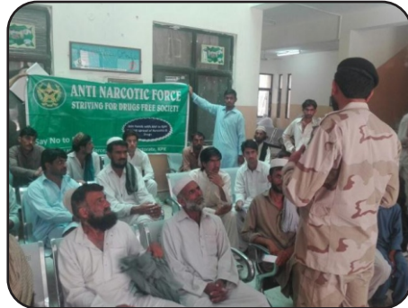
Awareness Lecture & Distribution of Awareness Material at DHQ Hospital, Kohat - 15 Aug 2016