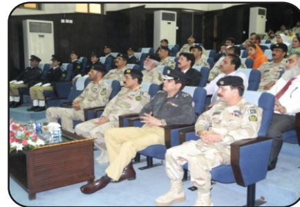
Passing out Parade of newly inducted ADs, Inspes & Inspes (Legal) 9 May to 5 Aug 2016