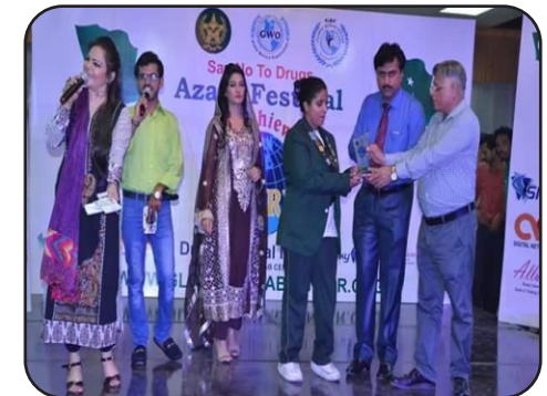
Azadi Family Festival at Global Welfare Organization, Lahore - 13 Aug 2016