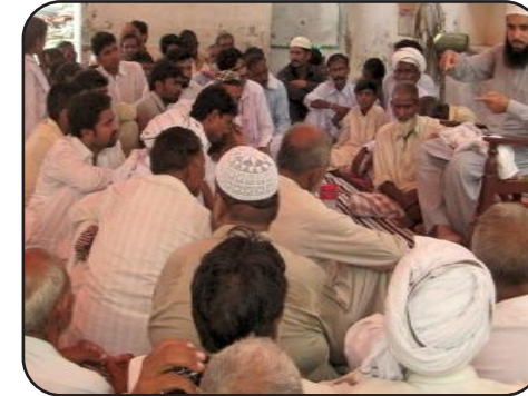
Awareness Seminar at Awami Falahi Society, Okara - 8 Aug 2016