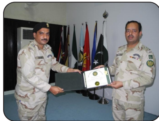
Conclusion ceremonial of Train the Trainer Course from 22 Aug to 2 Sep 2016