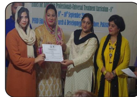
3 Days Training Session at Phoenix Foundation Lahore-8 to 10 Sep 2016