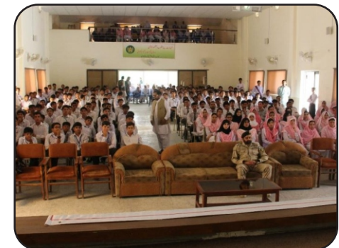
Awareness lecture at FG Public School, Quetta Cantt - 20 July 2016