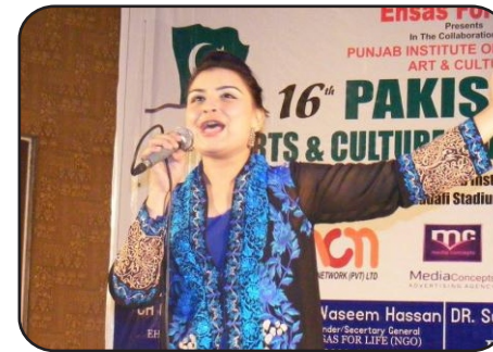
Award Show at Lahore - 8 Sep 2016