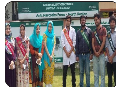
New Youth Ambassadors / Internees at MATRC on Volunteer assignment - 8 Aug 2016