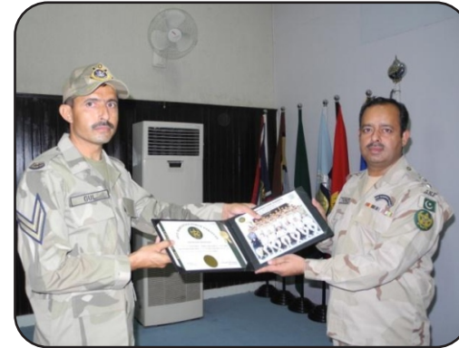
Conclusion ceremonial of Basic Drug Law Enforcement Course - I from 15 Aug to 9 Sep 2016