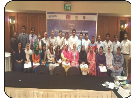
Participation in UNODC Training on "Drug Use Prevention & Treatment Services" at Lahore 15-21 Aug 2016