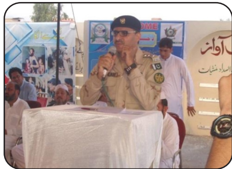
Seminar Against Drug Abuse at Kohat - 27 Sep 2016