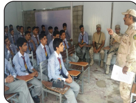
Awareness Lecture at Punjab College, Mansehra - 26 Jul 2016