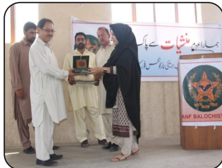
Awareness Lecture at Sardar Ishaq Khan Govt Boys High School, Quetta - 22 Aug 2016