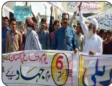
Awareness Rally at Pak-Pattan-6 Sep 2016