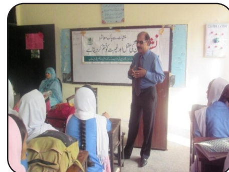
Awareness Seminar at Govt Yaseem Islamic Girls High School, Lahore - 29 Aug 2016

11.00 Kgs Hashish On pointation of arrested accused, 3x Associates were also arrested near Shell Filing Station, Tehkal, Peshawar and recovered 1.50 Kgs Heroin from Toyota Parado & 13.80 Kgs Heroin from Honda Civic Car.