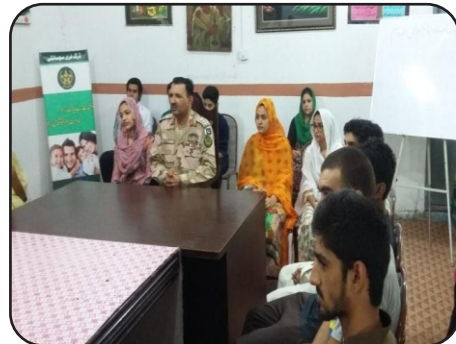
Awareness Session with Youth Ambassadors against drug abuse at RD North - 25 Jul 2016