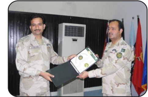
Conclusion ceremonial of Drug Law Enforcement Course from 18 Jul to 12 Aug 2016