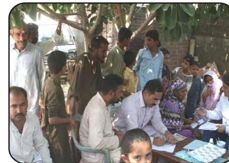
Free Medical Camp at Wazirabad - 11 Sep 2016