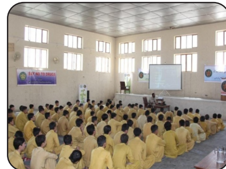
Participation in UNODC Training on "Drug Use Prevention & Treatment Services" at Lahore 15-21 Aug 2016