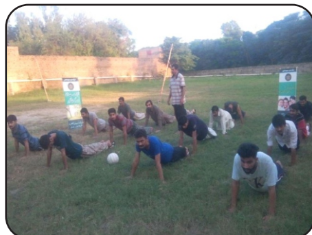
Activities at MATRC, Islamabad 22 to 26 Aug 2016