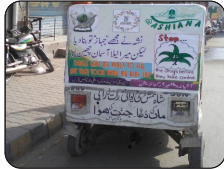
Awareness Rickshaw Campaign at Multan - 21 Jul 2016