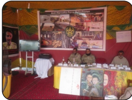
Awareness Stall at Askari Park, Quetta - 5 & 6 Sep 2016