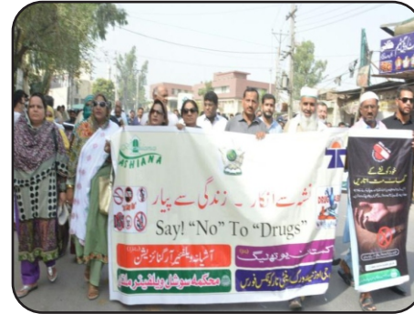
Drug Awareness Walk at Multan - 23 Jul 2016