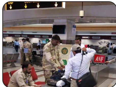
ANF Hajj - Operations Airports of Karachi, Lahore, Islamabad, Peshawar, Quetta, Faisalabad, Maultan, Sailkot, Rahim Yar Khan, Turbat, Gawadar - 2016