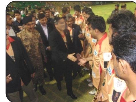
Azadi Night Cricket Match ANF V/S Civil Society at Moin Khan Cricket Academy, DHA, Karachi -13 Aug 2016