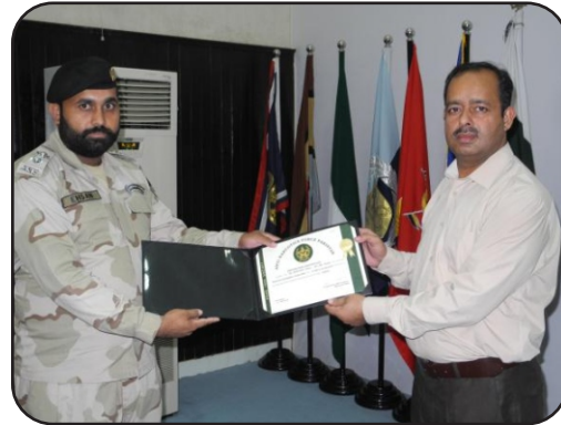
Conclusion ceremony of Financial Investigation Course from 19 Sep to 30 Sep 2016