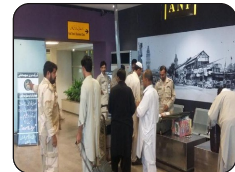
Awareness Campaign at BBIA and Hajj Complex, I-14 Sector, Islamabad - 1 to 6 Sep 2016