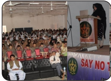
Awareness Lecture at Iqra Public School & College, Quetta Cantt. 22 Sep 2016