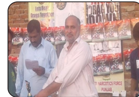
Awareness - Cricket Match at Okara Sep - 17 2016