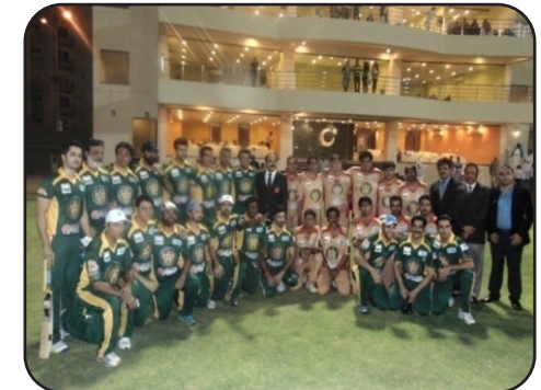
Governor Sindh, DG ANF, DG Rangers (Sindh) and FC (Sindh) graced the occasion