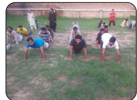
Health Activities at MATRC Islamabad - 21 to 22 Jul 2016