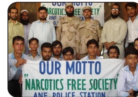
Awareness Lecture at Horizon Science High School, D.I Khan - 9 Sep 2016