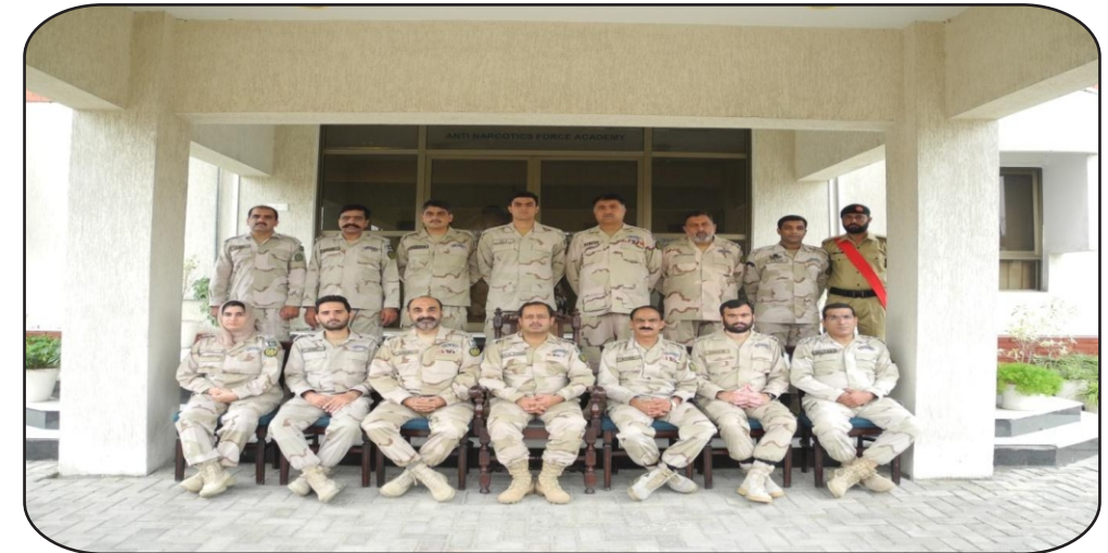
Conclusion ceremonial of Upper School Course from 18 Jul to 26 Aug 2016